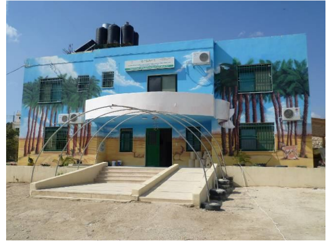
Auja Environment Center, West Bank.

The planned Jordan River Peace Park, at the confluence of the Yarmouk and Lower Jordan River, is proposed to combine two adjacent areas: Al Bakoora/Naharayim, where a small