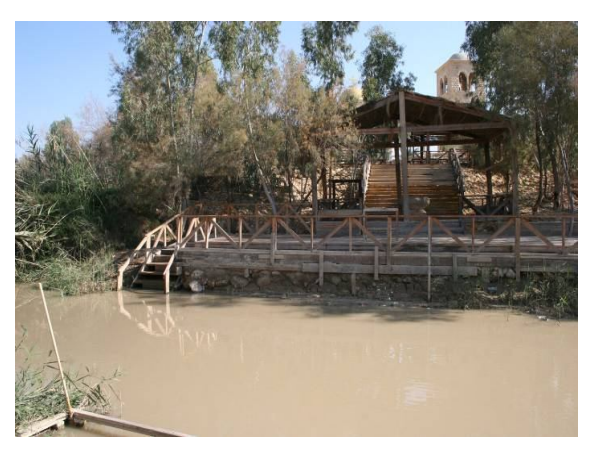
'Bethany Beyond the Jordan' baptism site along the Jordan River

As illustrated on the eastern side of the Jordan River, Palestine has immense potential for an influx of tourists to the baptism site on the western side of the Jordan River, establishing a very solid tourism industry and infrastructure, and justifying the need for a rehabilitated, healthy and accessible Jordan River. Being one of the most venerated sites in Christianity, the location of where it is believed the Israelites crossed over into the