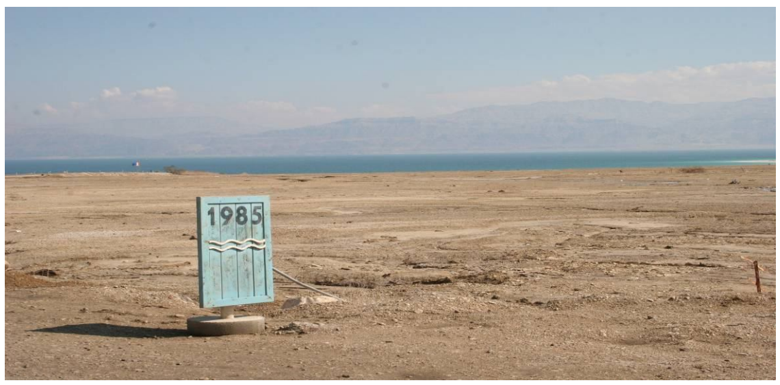
The Dead Sea water levels have been dropping by over one meter per year

One recent development proposal is the Moonlight Tourism City , planned on a 7 km strip of the Dead Sea, focusing on tourism, commerce, recreational, residential, therapeutic and cultural nodes.<sup>26</sup> Added to this could be a web of nature trails, connecting different hotel zones, allowing visitors to experience the 400-450 species of plants and nearly 150 species of animals in the area, many of which are rare or endemic to the Dead Sea basin and in particular the mouth of the LJR.<sup>27</sup>