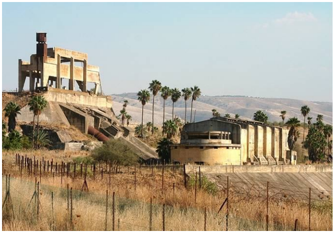
Hydro Electric Power Station. Site of the proposed Jordan River Peace Park.

The Jordan Valley also offers an abundance of historical cultural heritage sites, such as that found at the Old Gesher site, where three bridges cross the Lower Jordan River at the region's historical overland route. Old Gesher, also called 'Three Bridges', is situated within the proposed Jordan River Peace Park, which also includes the Hydro Electric Power Station. This power station used to supply electricity to Palestine and Jordan, before being abandoned in 1948. As part of the Peace Park plans, the workers' quarters have been