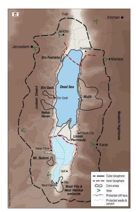
Proposed boundaries of a Dead Sea UNESCO protected site.

Political will and public support is essential in all riparian countries of the area, to promote cooperation on issues of conservation and rehabilitation of this unique body of water, and also to promote development that is not at the expense of the natural environment of the basin – development that is sustainable and compatible with future needs. The Jordan Valley/Dead Sea as a UNESCO MAB or World Heritage Site could offer an excellent opportunity to help ensure the sustainable development of the area.