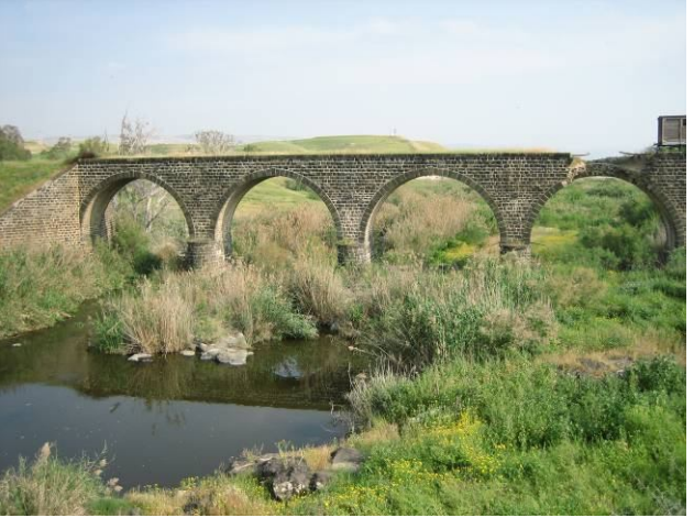
Ottoman Bridge over the Jordan River, and one of the traditional crossing points of the Jordan River.

island was created at the juncture of the Lower Jordan and Yarmouk Rivers, and the Jiser Al Majami/Gesher site, known as the historical crossing point of the Jordan River.<sup>35</sup> Despite being located outside of area covered within this report (it is north of the Green Line), it