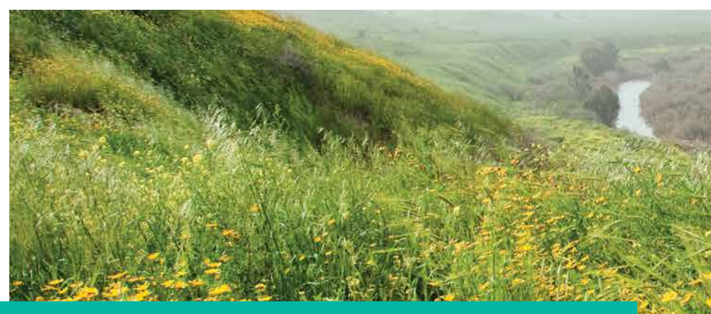
INTRODUCTION: Water, Ecology and the Jordan River – an issue of concern and opportunity for cooperative action